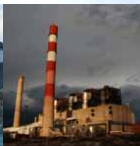
Thermal Energy and Energy Efficiency