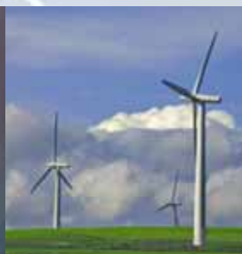
Renewable Energy Sources