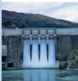
Hydropower and Water Resources