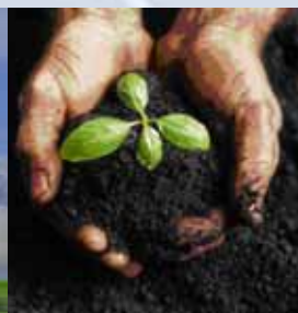
Environment and Spatial Planning