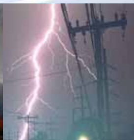
Electric Power Systems